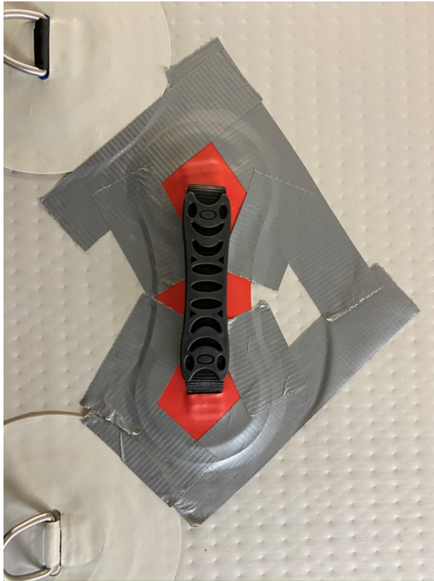
Accessory handle with Duct tape.